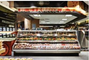
RETAIL & FOOD SERVICES

Hamilton has a vibrant, prime agricultural base in close proximity to its unique, urban environment. This provides a readily available and easy accessible skilled talent base and strategic manufacturing connections for collaboration. As a highly established and reputable food cluster, Hamilton is home to a strong food supply chain that is both streamlined and highly effective base for success. Collaboration is key to business success and in the food processing industry Hamilton’s temperature controlled facilities and logistics providers keep the industry running. To further support this important key sector, equipment and packaging suppliers and shovel-ready industrial land round out the business environment providing significant opportunity.