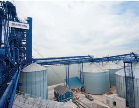
Richardson Grain Terminal – Hamilton Port Authority

Hamilton is located at the cross-section of numerous major highway arteries, including access to the busiest North America Free Trade Agreement (NAFTA) highway in North America. The city is within a 45-minute drive to a major U.S. border crossing and is well positioned to move Canadian food products to international and national food markets. This represents more than 150 million customers within a day’s drive. Home to an international airport providing 24-hour cargo service and international flights, the facility is soon to be home to a new climate-controlled cross-dock facility.