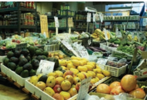
FRUITS & VEGETABLE