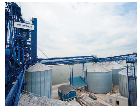
Richardson Grain Terminal - Hamilton Port Authority

Hamilton is located at the cross-section of numerous major highway arteries, including access to the busiest North America Free Trade Agreement (NAFTA) highway in North America. The city is within a 45-minute drive to a major U.S. border crossing and is well positioned to move Canadian food products to international and national food markets. This represents more than 150 million customers within a day's drive. Home to an international airport providing 24-hour cargo service and international flights, the facility is soon to be home to a new climate-controlled cross-dock facility.